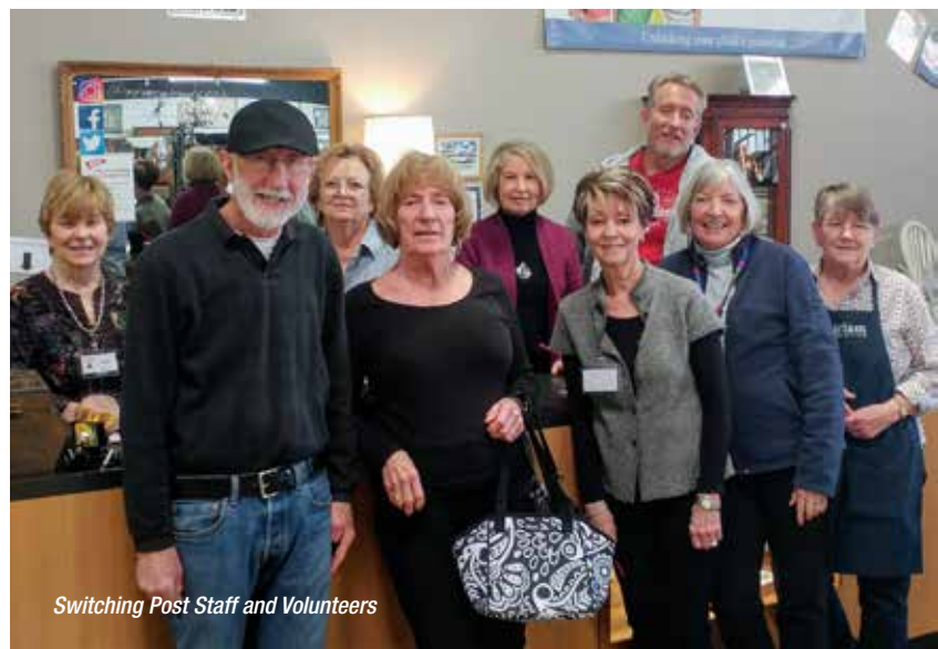
Switching Post Staff and Volunteers